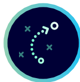
Breach and Attack Simulation