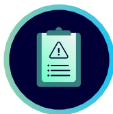
Cyber Risk Reporting