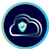
Hybrid Cloud Security

The next generation of security requires adding a continuous analysis of every potential attack path while providing additional contextual information to alerts and incident reports. Attack Path Management is one of the fastest growth spaces in Cyber Security, and presents a great opportunity to develop a new pipeline. Attack Path Management can help your customers with: