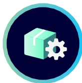
Supply Chain and Third Party Risk