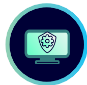
Active Directory Security